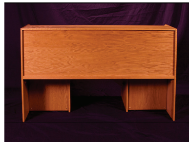
Left image of the Rolltop Custom shows both main and undermounted rack rolltop tambour doors opened (main rolltop does not cover lower rear when opened). Right image of desk rear shows both undermounted rack's rear removeable panels in place and desk rear. All exposed surfaces fully finished.