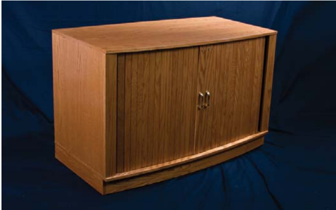
(model DR16E-II shown)

The HSA Executive DR Series Racks give you a convenient way to house and protect a wide variety of 19" rack mount and non-rackmount electronic equipment. Very suitable for boardroom, Houses of Worship, educational, corporate, recording and other professional environments, the HSA DR Series Racks are an elegant and easy way to aesthetically blend audio, video and many other electronic systems into their surroundings.