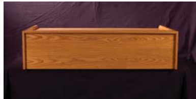
Left image of the Desktop Extended Rolltop shows the rolltop tambour door opened (rolltop door descends and "doubles-back" under the desks tabletop). Right image of desk shows fully finished desk rear.

Drawing Notes: Cable entrance/exit grommets are provided on the desk sides. The maximum usable depth (front to back) for equipment is considered approximately 31.00 inches and the maximum height is 9.00 inches. The maximum height is somewhat less near the front edge where the tambour curves downward. Please note that a small amount of this clearance is taken by the lock assembly. It approximately 0.5" thick out to about 2.750" from the sidewalls and about 0.75" thick within about 0.875" of the sidewalls. Wood is a natural product and overall working tolerances can be in the range of +/- 0.25" normally.