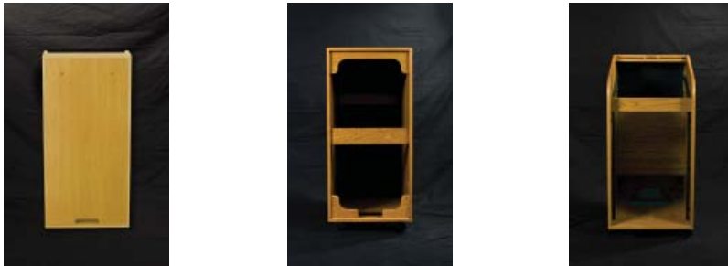
Left to right views of a PR Series Rack shows view of rear with lockable back door panel in place, door panel removed (with the rolltop closed) and front view of rolltop fully opened. Note the floor ventilation slotting and the cable/conduit cutout both in rack floor and door.