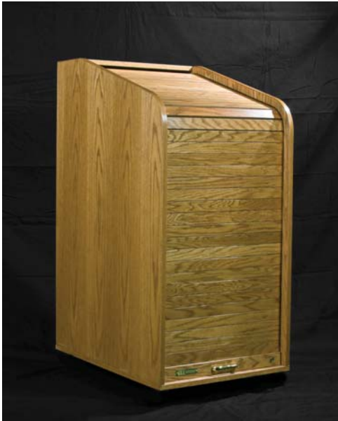
(model PR1016-II shown)

The HSA PR1016-II/PR1216-II Racks give you a convenient way to house and protect a wide variety of 19" rack mount and non-rackmount electronic equipment. Very suitable for boardroom, Houses of Worship, educational, corporate, recording and other professional environments, the HSA PR Racks are an elegant and easy way to aesthetically blend audio, video and many other electronic systems into their surroundings.