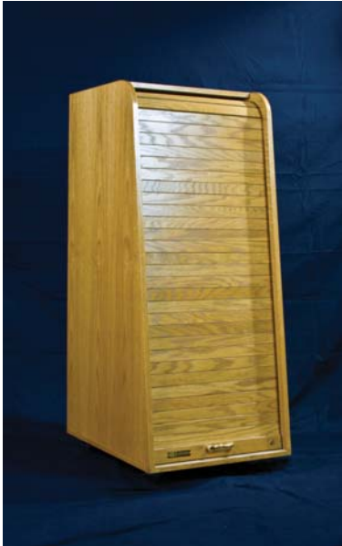
(model SLRR24-II shown)

The HSA Slant RollRacks give you a convenient way to house and protect a wide variety of 19" rack mount and non-rack-mount electronic equipment. Very suitable for boardroom, Houses of Worship, educational, corporate, recording and other professional environments, the HSA Slant RollRacks are an elegant and easy way to aesthetically blend audio, video and many other electronic systems into their surroundings.