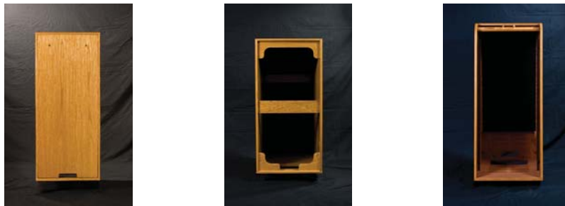
Left to right views of a Slant RollRack 24 shows view of rear with lockable back door panel in place, back door panel removed and front view with the rolltop door fully opened. Note the floor ventilation slotting and the easy access cable/conduit cutout both in rack floor and rear door panel.