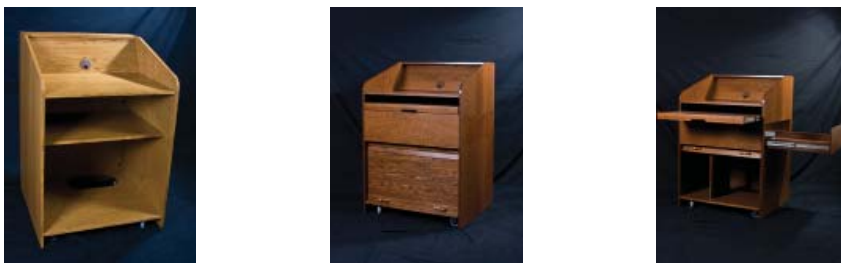
Left image of USAVID32 in Basic configuration. Center and right shows USAVID32 with optional keyboard pullout, rack bay, rolltop tambour door and right-hand document camera/projector drawer.