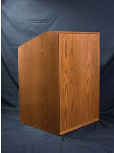
(model USAVID32 shown)

The HSA USAVID Series is a versatile presentation desk/podium designed to give you a convenient and configurable platform for teaching, lecturing and other presentation situations and a way to house and protect a wide variety of 19" rack mount and non-rackmount electronic equipment. Designed for the boardroom, auditorium, educational, corporate, and other professional environments, HSA USAVID's can provide essential podium functionality or can be optioned and customized to meet the requirements of today's audio, video, digital and control systems.