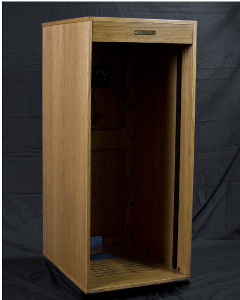
(model CLAS24-II shown)

The HSA Classic Racks give you a convenient way to house and protect a wide variety of 19" rack mount and non-rackmount electronic equipment. Very suitable for boardroom, Houses of Worship, educational, corporate, recording and other professional environments, the HSA Classic Racks are an elegant and easy way to aesthetically blend audio, video and many other electronic systems into their surroundings.