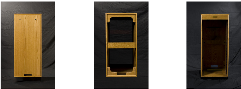
Left to right views of a Classic Series Rack shows view of rear with machine screw secured back door panel in place, door panel removed and front view of rack. Note the floor ventilation slotting and the cable/conduit cutout in rack floor and cable exit in rear door panel.