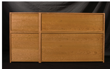
Left image of the Inspire Standard Rolltop shows both main and side rack rolltop tambour doors opened. Right image of desk and rack rear shows removable lower Modesty Panels (included with all Inspire Desks). All exposed surfaces fully finished.