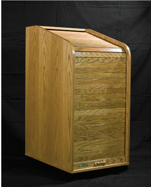
(model PR1016-II shown)