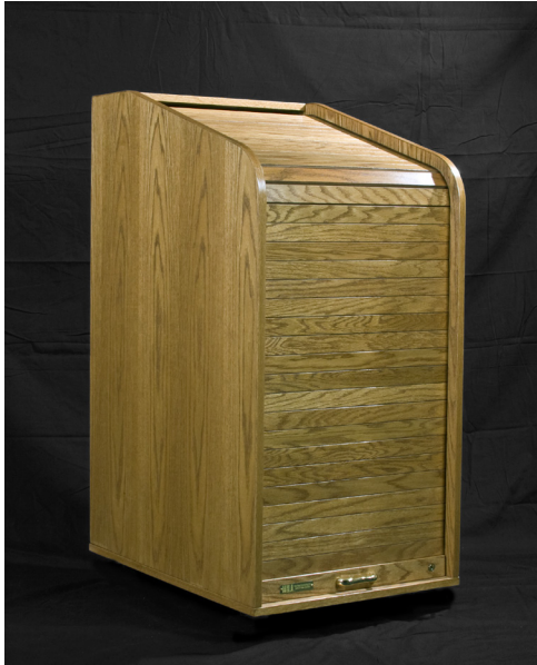
(model PR1016-II shown)

The HSA PR1016-II/PR1216-II/PR1416-II Racks give you a convenient way to house and protect a wide variety of 19" rack mount and non-rackmount electronic equipment. Very suitable for boardroom, Houses of Worship, educational, corporate, recording and other professional environments, the HSA High Rise Standard Rolltops are an elegant and easy way to beautifully blend audio, video and many other electronic systems into their surroundings for easy operation by authorized users.