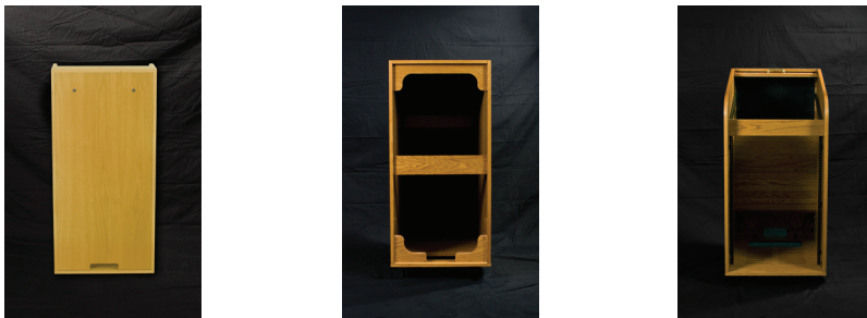
Left to right views of a PR Series Rack shows view of rear with removable back door panel in place, door panel removed (with the rolltop closed) and front view of rolltop fully opened. Note the floor ventilation slotting and the cable/conduit cutout both in rack floor and door.