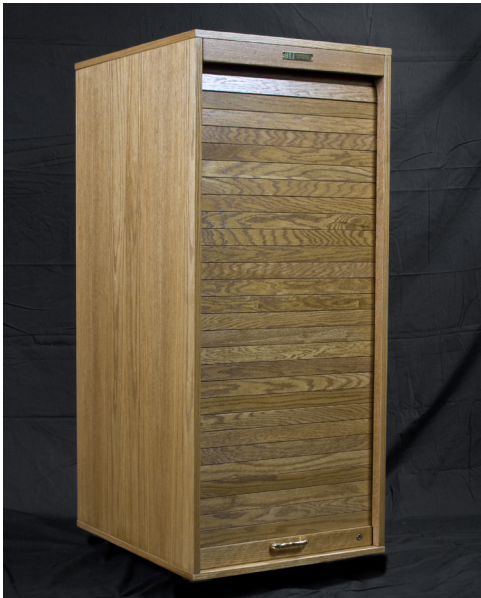
(model RR24-II shown)

The HSA RollRacks give you a convenient way to house and protect a wide variety of 19" rack mount and non-rackmount electronic equipment. Very suitable for boardroom, Houses of Worship, educational, corporate, recording and other professional environments, the HSA RollRacks are an elegant and easy way to aesthetically blend audio, video and many other electronic systems into their surroundings.