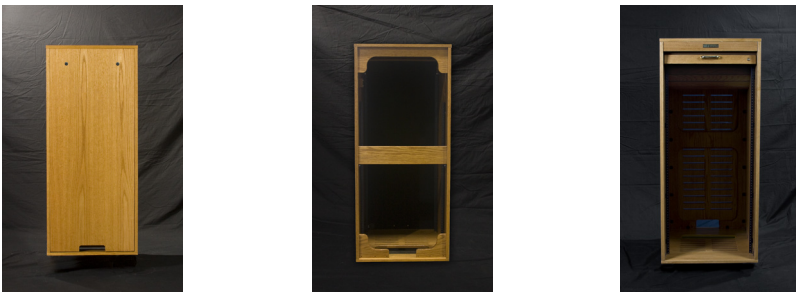
Left to right views of a RollRack 24 shows view of rear with tab-locked and machine screw secured back door panel in place, door panel removed (shown with OPTIONAL rear rack rail set and with the rolltop door closed) and front view with the rolltop door fully opened. Note the floor ventilation slotting and the easy access cable/conduit cutout both in rack floor and rear door panel.