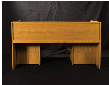
Left image of the Super Extended Rolltop shows both main and undermounted racks rolltop tambour doors opened (main rolltop descends and covers lower rear when opened). Right image of desk rear shows both undermounted rack's rear removable panel in place with main rolltop in closed position. All exposed surfaces fully finished.