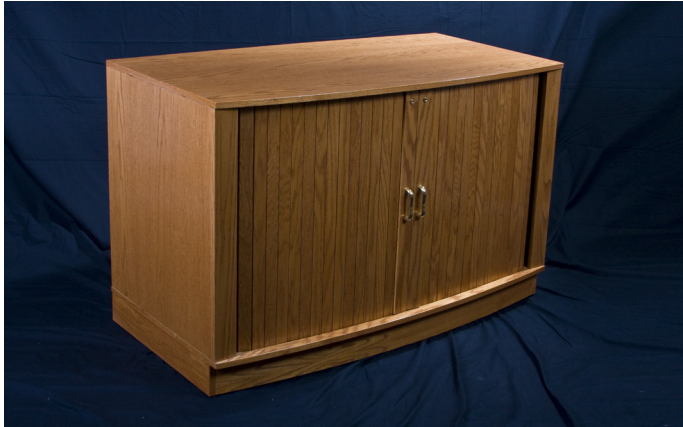
(model DR16E-II shown)

The HSA Executive DR Series Racks give you a convenient way to house and protect a wide variety of 19" rack mount and non-rackmount electronic equipment. Very suitable for boardroom, Houses of Worship, educational, corporate, recording and other professional environments, the HSA DR Series Racks are an elegant and easy way to aesthetically blend audio, video and many other electronic systems into their surroundings.