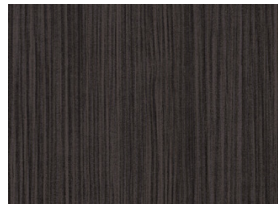
Black Havana Pine